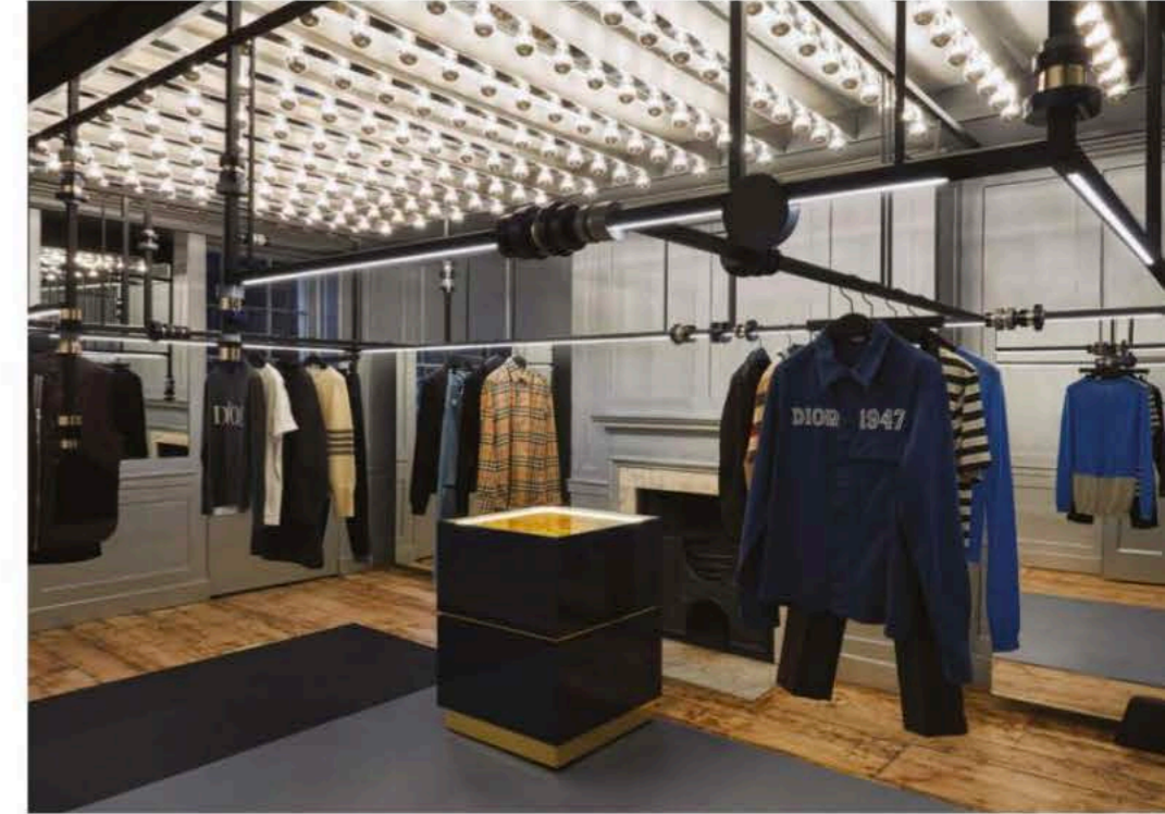
Right: The multi-brand, luxury boutique based in Mayfair.

"The designers were adamant that minimal visual impact on any of the spaces would be required - and that brief very soon crystallised into 'no impact!'"