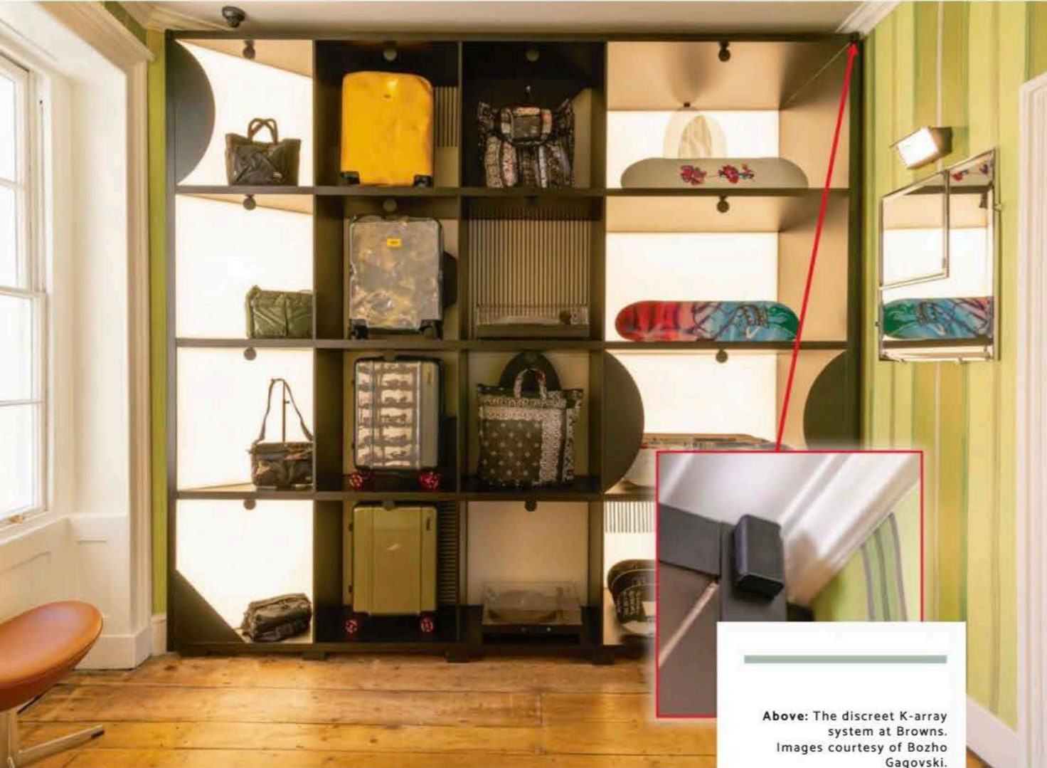
Above: The discreet K-array system at Browns.

In the main event space, known as the Yellow Room, a pair of Thunder-KMT18P 18" subwoofers lay down the low-end foundation for a formidable Kayman-KY102 portable line array system with sufficient grunt to prompt a well-known visiting DJ to enquire where he could get